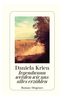
Someday We'll Tell Each Other Everything 272 pages 2022 🏆 Award winner 🎬 Movie Adaptation 📈 Bestseller