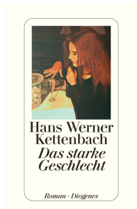
The Stronger Sex 448 pages 2009