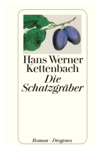
The Treasure-Hunters 544 pages 1998