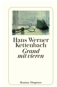
Grand With Four 240 pages 2000