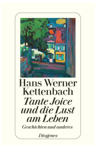
Aunt Joice and the Joy of Life 432 pages 2010