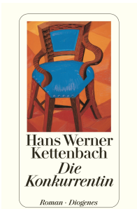
The Rival 528 pages 2002