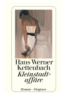
Small Town Affairs 512 pages 2004