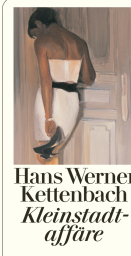
Small Town Affairs 512 pages 2004