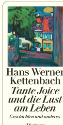
Aunt Joice and the Joy of Life 432 pages 2010