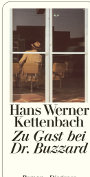
A Visit to Dr. Buzzard 368 pages 2006