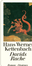
David's Revenge 304 pages 1994