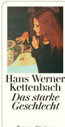
The Stronger Sex 448 pages 2009