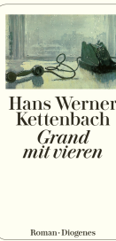
Grand With Four 240 pages 2000