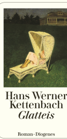
Black Ice 272 pages 2001