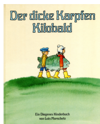
The Fat Carp Kilobald 32 pages, 22 x 27.5 cm 1978