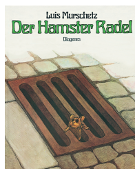
Hamster's Journey 32 pages, 22 x 27.5 cm 1975