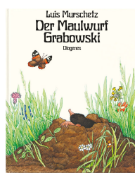
Mister Mole 32 pages, 22 x 27.5 x 0.7 cm 1972