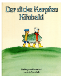
The Fat Carp Kilobald 32 pages, 22 x 27.5 cm 1978