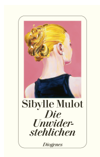
The Irresistibles 160 pages 2007