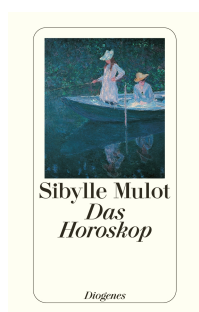
The Horoscope 128 pages 1997