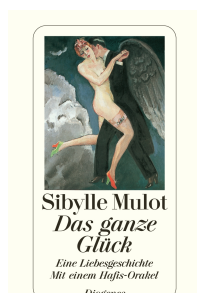
Perfect Happiness 176 pages 2001