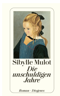
Innocent Years 240 pages 1999