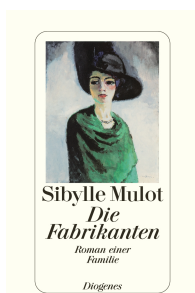
The Manufactures 400 pages 2005