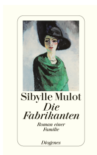
The Manufactures 400 pages 2005