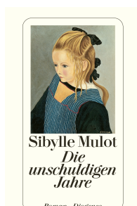
Innocent Years 240 pages 1999