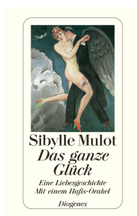
Perfect Happiness 176 pages 2001