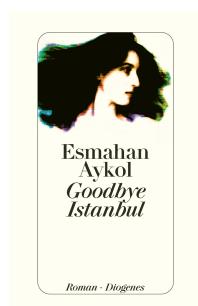
Goodbye Istanbul 368 pages 2007