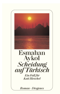
Divorce in Turkish 336 pages 2008