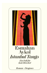
Istanbul Tango 336 pages 2016