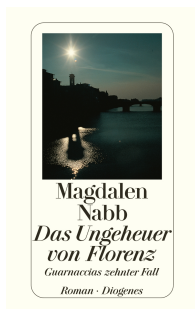
The Monster of Florence 544 pages 1997