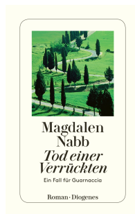
The Marshal and the Madwoman 320 pages 1997