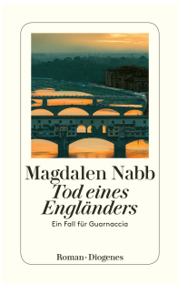
Death of an Englishman 224 pages 1991