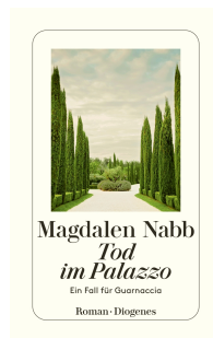
The Marshal Makes His Report 288 pages 1995