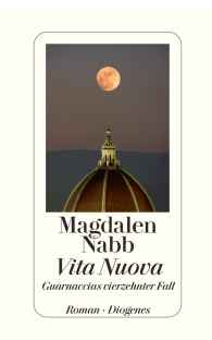
Vita Nuova 336 pages 2008

Magdalen Nabb (1947 – 2007) studied at the Manchester College of Art, where she began to write. From 1975 onward she lived in Florence, working as a journalist and novelist. Nabb became famous for her Guarnaccia crime novels – she wrote 14 novels about the crotchety yet likeable Maresciallo – and also wrote books for children and teenagers.