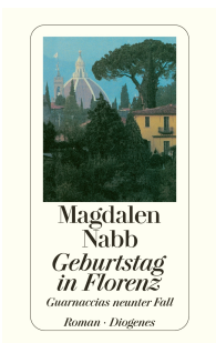
The Marshal at the Villa Torrini 272 pages 1998