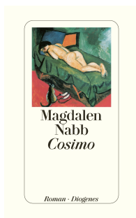
Cosimo 304 pages 2004