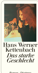
The Stronger Sex 448 pages 2009