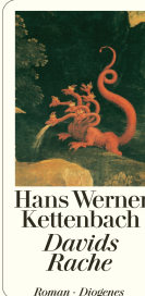
David's Revenge 304 pages 1994