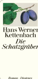
The Treasure-Hunters 544 pages 1998