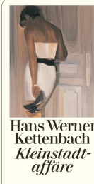
Small Town Affairs 512 pages 2004