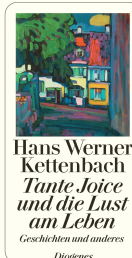
Aunt Joice and the Joy of Life 432 pages 2010