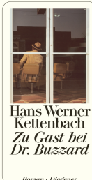
A Visit to Dr. Buzzard 368 pages 2006