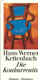
The Rival 528 pages 2002