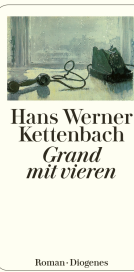
Grand With Four 240 pages 2000