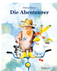
The Adventurers 28 pages, 22 x 27.5 cm 1994

Helme Heine, born in Berlin in 1941, has authored more than thirty children's books, with millions of copies sold around the world. Since publishing his first children's book in 1976, Helme Heine has received numerous awards and honours, including the ›Grand Prize of the German Academy of Children's and Young Adults' Literature‹ (1991 for his life's work), and the ›Best Illustrated Children's Books of the Year‹ by the New York Times several times.