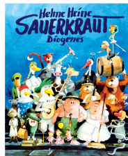
Sauerkraut 176 pages, 22 x 27 cm 1992