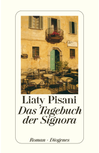
The Signora's Diary 288 pages 2007