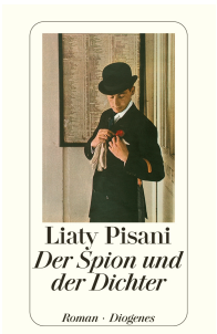
The Spy And the Poet 416 pages 1997