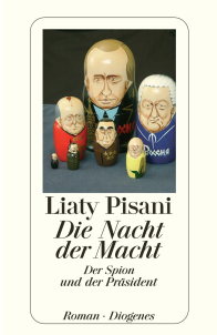
The Spy and the President 352 pages 2002