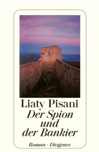
The Spy and the Banker 448 pages 1999