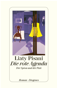
The Red Diary 416 pages 2012