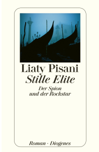
The Spy and the Rockstar 384 pages 2004