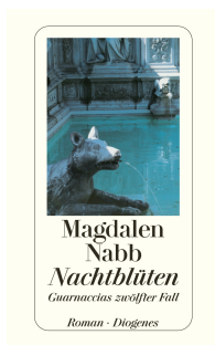
Some Bitter Taste 336 pages 2002