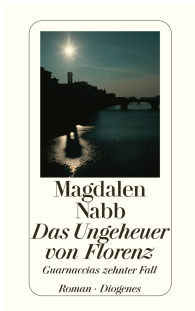
The Monster of Florence 544 pages 1997