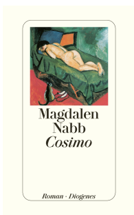
Cosimo 304 pages 2004