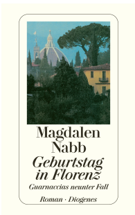
The Marshal at the Villa Torrini 272 pages 1998