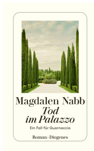
The Marshal Makes His Report 288 pages 1995