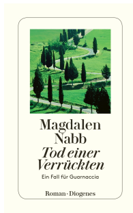
The Marshal and the Madwoman 320 pages 1997