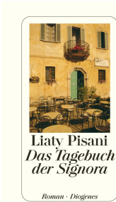
The Signora's Diary 288 pages 2007