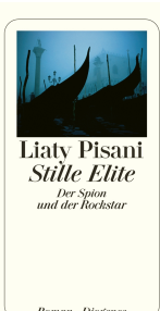
The Spy and the Rockstar 384 pages 2004