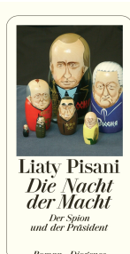
The Spy and the President 352 pages 2002