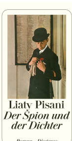
The Spy And the Poet 416 pages 1997