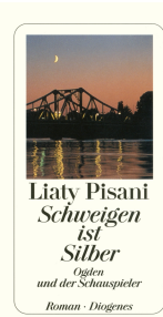
The Spy and the Actor 352 pages 2000