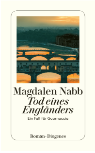
Death of an Englishman 224 pages 1991