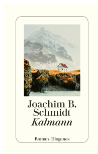
Kalmann 352 pages 2020 🏆 Award winner 🏆 Bestseller