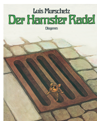
Hamster's Journey 32 pages, 22 x 27.5 cm 1975