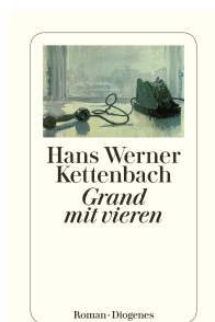
Grand With Four 240 pages 2000