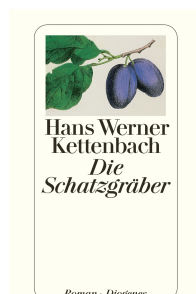
The Treasure-Hunters 544 pages 1998