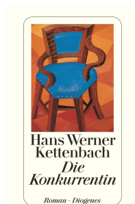
The Rival 528 pages 2002