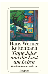
Aunt Joice and the Joy of Life 432 pages 2010