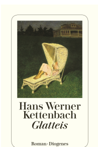
Black Ice 272 pages 2001