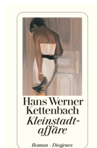
Small Town Affairs 512 pages 2004