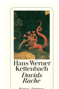
David's Revenge 304 pages 1994