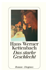
The Stronger Sex 448 pages 2009