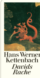
David's Revenge 304 pages 1994