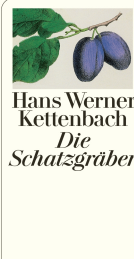
The Treasure-Hunters 544 pages 1998