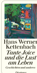
Aunt Joice and the Joy of Life 432 pages 2010