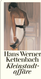
Small Town Affairs 512 pages 2004