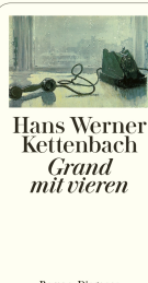
Grand With Four 240 pages 2000