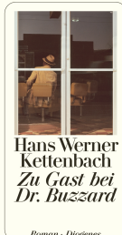
A Visit to Dr. Buzzard 368 pages 2006