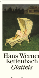
Black Ice 272 pages 2001