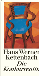
The Rival 528 pages 2002