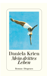
My Third Life 304 pages 2024