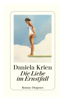
Love in Case of Emergency 288 pages 2019 🏆 Award winner 🔥 Bestseller