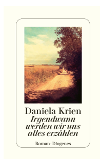
Someday We'll Tell Each Other Everything 272 pages 2022 🏆 Award winner 🎬 Movie Adaptation 🔥 Bestseller