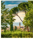
Magdalen Nabb Tod einer Queen Ein Fall für Guarnaccio Roman · Diogenes