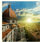
Magdalen Nabb Tod im Frühling Ein Fall für Guarnaccio Roman · Diogenes