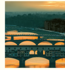
Magdalen Nabb Tod eines Engländers Ein Fall für Guarnaccio Roman · Diogenes