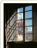
Magdalen Nabb Alta moda Guarnaccias elfter Fall Roman · Diogenes