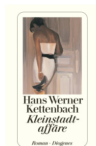
Small Town Affairs 512 pages 2004