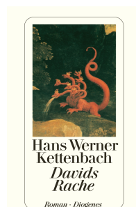
David's Revenge 304 pages 1994