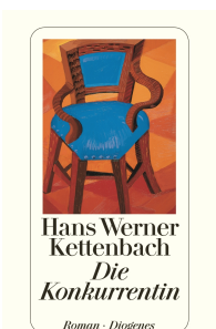
The Rival 528 pages 2002