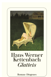
Black Ice 272 pages 2001