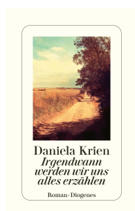
Someday We'll Tell Each Other Everything 272 pages 2022 🏆 Award winner 🎬 Movie Adaptation 📈 Bestseller