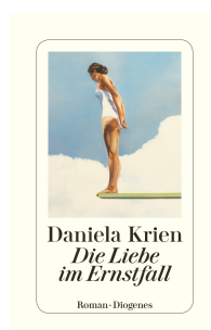
Love in Case of Emergency 288 pages 2019 🏆 Award winner 📈 Bestseller