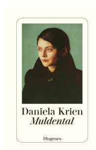
Muldental 240 pages 2020 📈 Bestseller