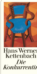
The Rival 528 pages 2002