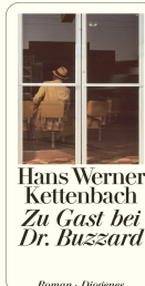
A Visit to Dr. Buzzard 368 pages 2006