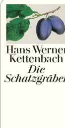
The Treasure-Hunters 544 pages 1998