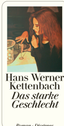
The Stronger Sex 448 pages 2009