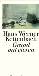
Grand With Four 240 pages 2000