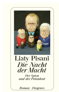
The Spy and the President 352 pages 2002