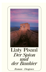
The Spy and the Banker 448 pages 1999