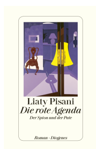
The Red Diary 416 pages 2012