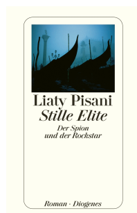
The Spy and the Rockstar 384 pages 2004