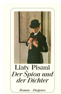
The Spy And the Poet 416 pages 1997