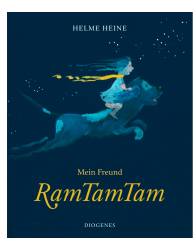
My Friend RamTamTam 36 pages, 22 x 27.5 x 0.8 cm 2021

Helme Heine, born in Berlin in 1941, has authored more than thirty children's books, with millions of copies sold around the world. Since publishing his first children's book in 1976, Helme Heine has received numerous awards and honours, including the ›Grand Prize of the German Academy of Children's and Young Adults' Literature‹ (1991 for his life's work), and the ›Best Illustrated Children's Books of the Year‹ by the New York Times several times.