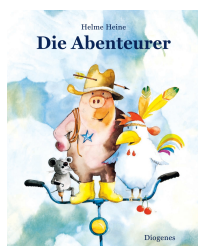
The Adventurers 28 pages, 22 x 27.5 cm 1994