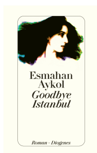
Goodbye Istanbul 368 pages 2007