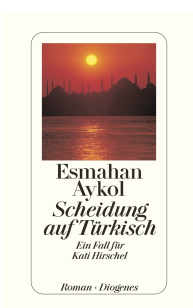
Divorce in Turkish 336 pages 2008