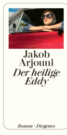
Holy Eddy 256 pages 2009