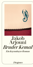
Brother Kemal 240 pages 2012