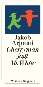
Cherryman Hunts Mister White 176 pages 2011