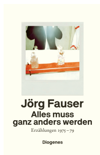
Jörg Fauser Alles muss ganz anders werden Erzählungen 1975–79 Diogenes