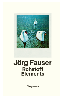
Jörg Fauser Rohstoff Elements Diogenes