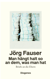
You Just Cling On to What You've Got 464 pages 2023