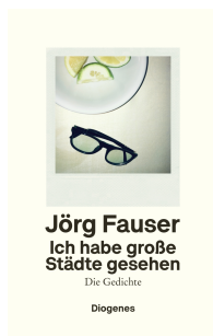
Jörg Fauser Ich habe große Städte gesehen Die Gedichte Diogenes