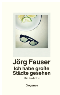
Jörg Fauser Ich habe große Städte gesehen Die Gedichte Diogenes

Everything Must Be Completely Different 288 pages 2020