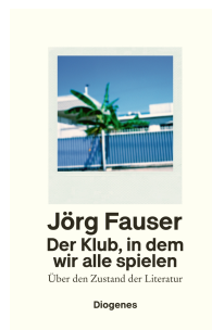
The Club We All Play In 400 pages 2020