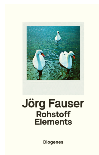
Jörg Fauser Rohstoff Elements Diogenes