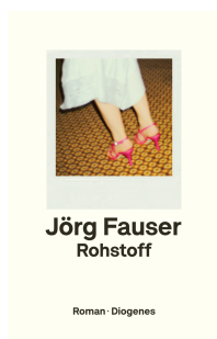
Jörg Fauser Rohstoff Roman · Diogenes