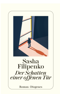
The Shadow of an Open Door 272 pages 2024 🏆 Award winner

»Sasha Filipenko is one of those young writers who immediately gained a reputation for being a serious author. If you want to get inside the head of modern, young Russia, read Filipenko.« – Svetlana Alexievich / (Nobel Prize winner 2015)