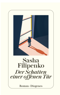
The Shadow of an Open Door 272 pages 2024 🏆 Award winner

Sasha Filipenko, born in Minsk in 1984, is a Belarusian author who writes in Russian. After leaving his training in classical music, he studied literature in St. Petersburg and worked as a journalist, scriptwriter, television presenter and gag writer for a satirical show. His novels Red Crosses and The Hunt were Spiegel bestsellers. Filipenko is an ardent football fan and lived in St. Petersburg until 2020. He had to leave Russia with his family and currently lives in Switzerland.