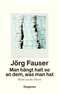
You Just Cling On to What You've Got 464 pages 2023

Jörg Fauser (1944 – 1987) was born near Frankfurt. After dropping out of university, he spent some years living in Istanbul and London, making a living in office jobs, as an airport worker and night watchman, among other things. In 1974, he switched to writing. His novels, poems, newspaper articles and short stories occupy an exceptional position in German literature. Jörg Fauser died in an accident on a motorway near Munich on the night after his birthday. »At first, I didn't want to become a professional writer, I just wanted to write. I imagined a normal existence while producing a few eternal things on the side.« Jörg Fauser