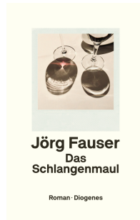
The Snake Mouth 320 pages 2019