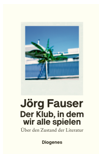
The Club We All Play In 400 pages 2020