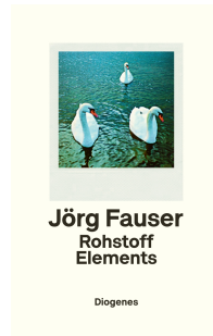
Raw Material Elements 320 pages 2019