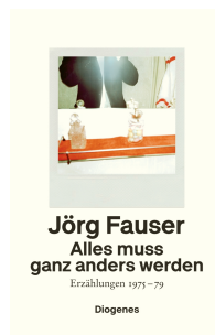
Everything Must Be Completely Different 288 pages 2020