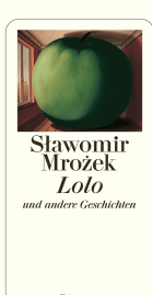
Lolo 304 pages 2000