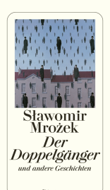
The Doppelgänger 272 pages 2000