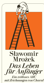
Life for Beginners 192 pages 2004