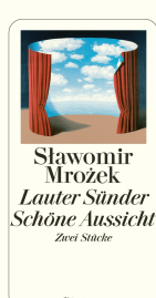
All Sinners and A Lovely View 208 pages 2002