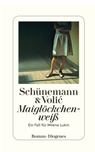
Lily-of-the-Valley White 352 pages 2017