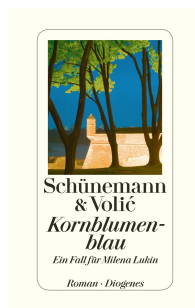
Cornflower Blue 368 pages 2013