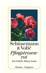
Peony Red 368 pages 2016