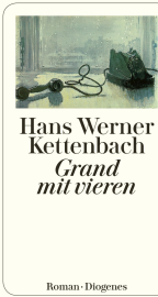
Grand With Four 240 pages 2000