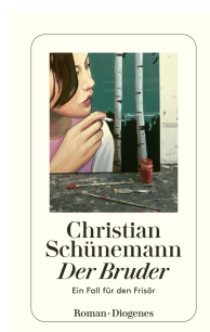
The Brother 288 pages 2008