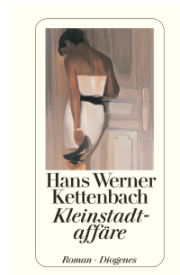
Small Town Affairs 512 pages 2004