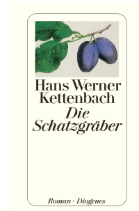
The Treasure-Hunters 544 pages 1998