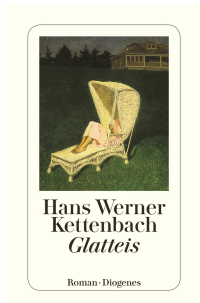
Black Ice 272 pages 2001