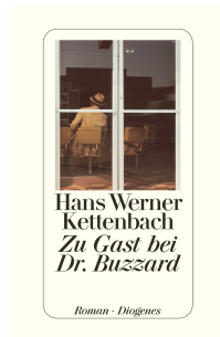
A Visit to Dr. Buzzard 368 pages 2006