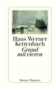
Grand With Four 240 pages 2000