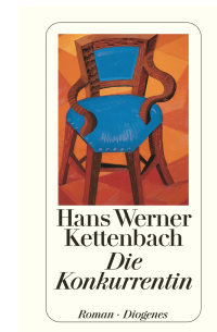
The Rival 528 pages 2002