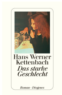
The Stronger Sex 448 pages 2009

Hans Werner Kettenbach (1928 - 2018) studied many things over the years in four universities; he has worked as an advertising salesman, a shorthand secretary for the football magazine ›Kicker‹, a radio editor and finally as the editor of a newspaper. He wrote his first novel at the age of fifty. He has written a total of fourteen, five of which have been filmed. Critics have compared them to the works of Sjöwall/Wahlöö (›Plärrer‹), Simenon and Patricia Highsmith (›FAZ‹). In 2009 Kettenbach was awarded the ›Ehrengläuser‹ prize for crime writing for his life's work.