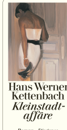
Small Town Affairs 512 pages 2004