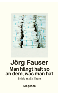
You Just Cling On to What You've Got 464 pages 2023

Jörg Fauser (1944 – 1987) was born near Frankfurt. After dropping out of university, he spent some years living in Istanbul and London, making a living in office jobs, as an airport worker and night watchman, among other things. In 1974, he switched to writing. His novels, poems, newspaper articles and short stories occupy an exceptional position in German literature. Jörg Fauser died in an accident on a motorway near Munich on the night after his birthday. »At first, I didn't want to become a professional writer, I just wanted to write. I imagined a normal existence while producing a few eternal things on the side.« Jörg Fauser