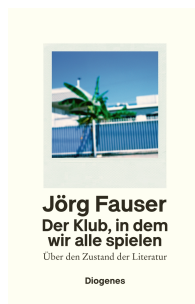
The Club We All Play In 400 pages 2020