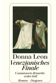
Death at La Fenice 352 pages 1993 Award winner Movie Adaptation