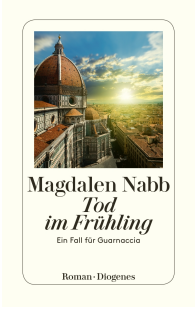
Death in Springtime 224 pages 1988