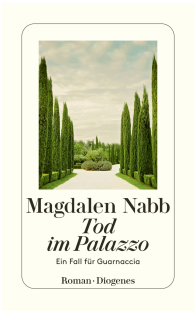
The Marshal Makes His Report 288 pages 1995