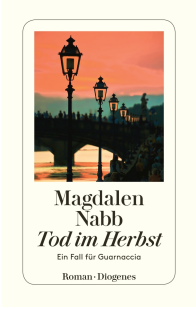
Death in Autumn 224 pages 1990