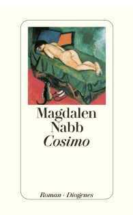
Cosimo 304 pages 2004