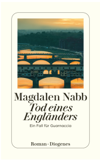
Death of an Englishman 224 pages 1991