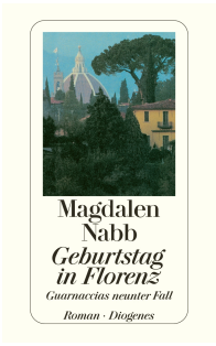
The Marshal at the Villa Torrini 272 pages 1998