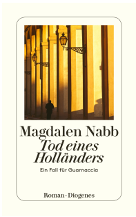
Death of a Dutchman 288 pages 1992