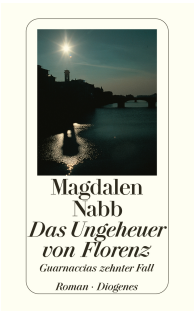
The Monster of Florence 544 pages 1997