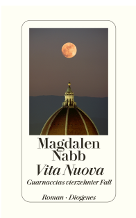
Vita Nuova 336 pages 2008

Magdalen Nabb (1947 – 2007) studied at the Manchester College of Art, where she began to write. From 1975 onward she lived in Florence, working as a journalist and novelist. Nabb became famous for her Guarnaccia crime novels – she wrote 14 novels about the crotchety yet likeable Maresciallo – and also wrote books for children and teenagers.