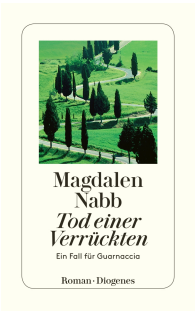
The Marshal and the Madwoman 320 pages 1997