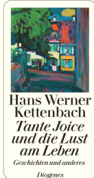
Aunt Joice and the Joy of Life 432 pages 2010