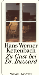
A Visit to Dr. Buzzard 368 pages 2006