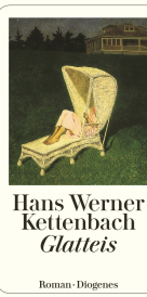
Black Ice 272 pages 2001