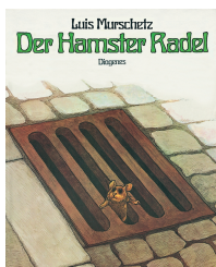
Hamster's Journey 32 pages 1975