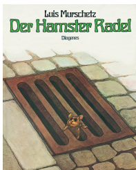
Hamster's Journey 32 pages 1975