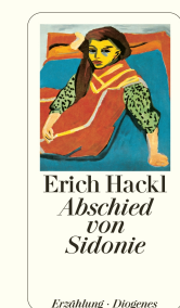
Farewell Sidonia 128 pages 1989

Award winner Movie Adaptation Bestseller