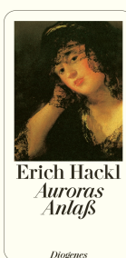
Aurora's Motive 144 pages 1987

Award winner Movie Adaptation Bestseller