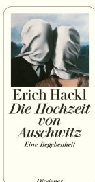
Wedding at Auschwitz 192 pages 2002