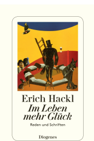
More Happiness in Life 432 pages 2019