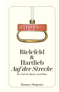
Non-stop to Berlin 368 pages 2011