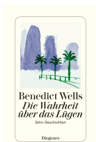
The Truth About Lying 256 pages 2018