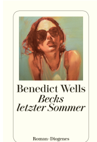
Beck's Last Summer 464 pages 2008