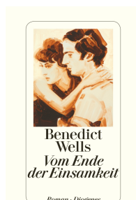
The End of Loneliness 368 pages 2016