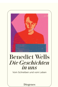
The Stories Inside Us 400 pages 2024

Benedict Wells, born in Munich in 1984, moved to Berlin after completing school and focused on his writing, earning a living with various jobs. His fourth novel, The End of Loneliness , spent more than a year and a half on the Spiegel Bestseller list, was awarded the 2016 ›European Union Prize for Literature‹, among other awards, and has been published in 39 languages. His latest novel Hard Land was awarded the independent young adult jury's ›German Youth Literature Award‹ in 2022. After several years in Barcelona, Benedict Wells now lives in Zurich.