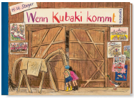
When Kubaki Comes 48 pages 1976