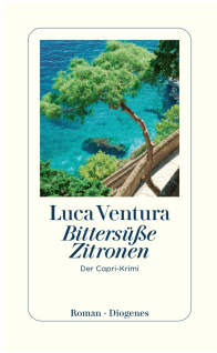
Bittersweet Lemons 320 pages 2021