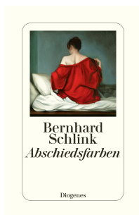
Colours of Farewell 240 pages 2020 🏆 Bestseller