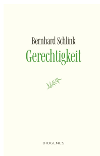
Justice 208 pages 2026

›The truly masterly aspect of Schlink's prose is its intelligence – an intelligence that is firmly rooted in common sense.« – Welt am Sonntag, Hamburg