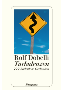
Turbulence 160 pages 2007