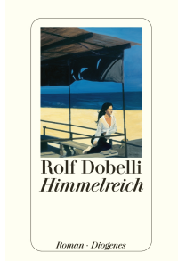
Himmelreich 384 pages 2006