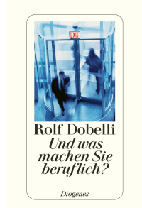
What Do You Do for a Living? 240 pages 2004