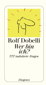
Who Am I? 144 pages 2007