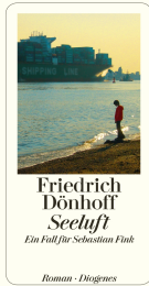
Sea Breeze 368 pages 2013