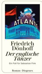
The English Dancer 304 pages 2010