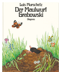
Mister Mole 32 pages 1972