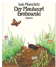
Mister Mole 32 pages 1972